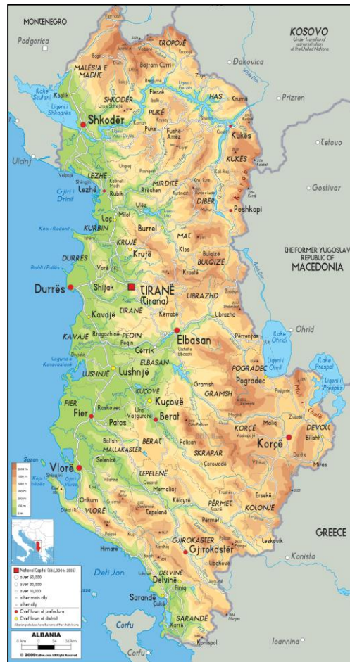
Map 1: Topographic map of Albania

1. Albania has a total surface area of 28,748 km 2 . It borders Montenegro to the northwest, Kosovo to the northeast, Macedonia to the north and east, and Greece to the south and southeast. Its coastline, facing the Adriatic and Ionian seas, is around 362 km long (see Map 1 below)